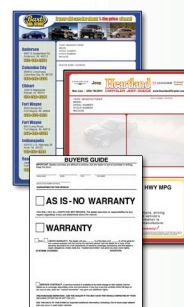
Set of Window Sticker and Buyers Guide